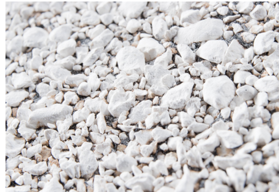
Photo not actual size, granules are shown at approximately 10X magnification.

Reflective Roofing Granules: Bright white granules specifically designed for high reflectivity and durability.