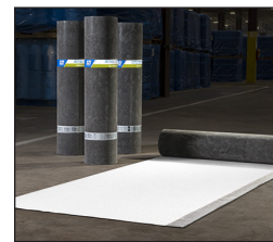
Colors: Bright white only