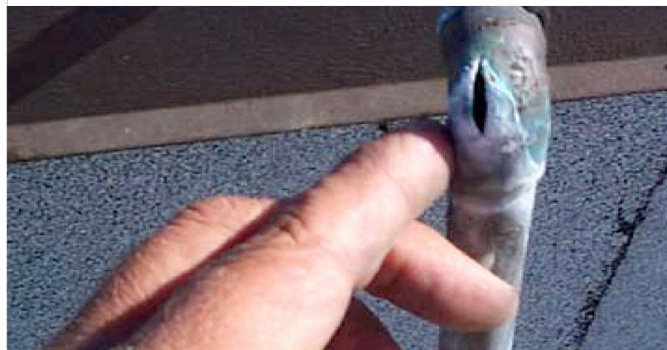
1 / When a water line split on this roof ...