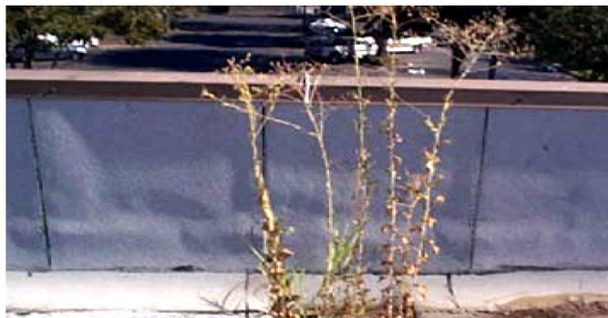
3 / and gave weeds a chance to grow.