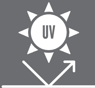
UV PROTECTED TOP SURFACE